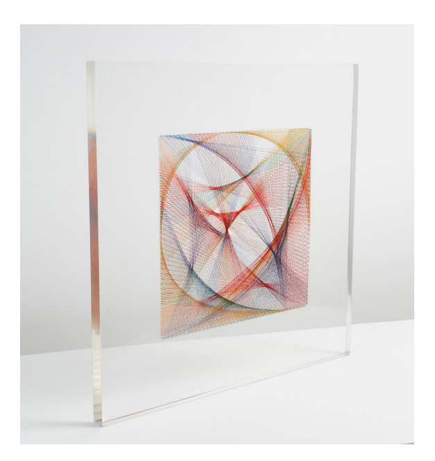
Sue Fuller String Composition #552, 1966

Fuller's meticulous geometric constructions in string represent at once the delicate precision of a seamstress and the force and stability of an industrial manufacturer. Shown for the first time in decades as a large ensemble at Luxembourg + Co., London, the exhibition Sue Fuller: Into the Composition invites viewers to explore a universe hanging by threads.